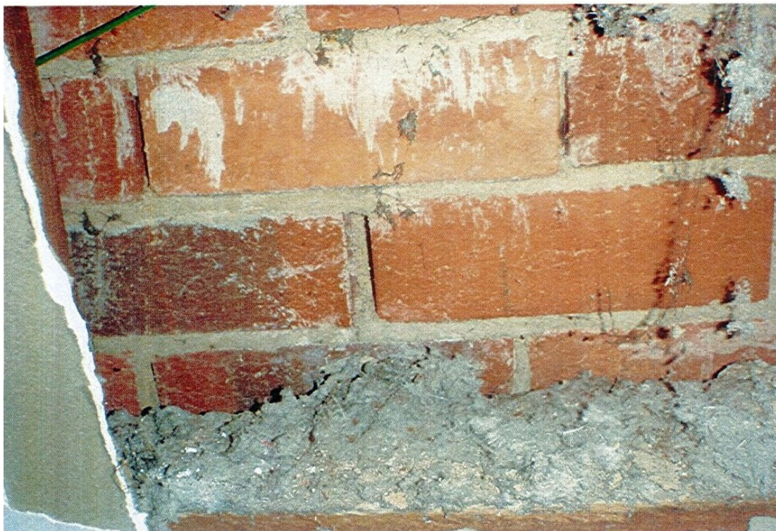
Figure 2 Loose-fill asbestos fibres present on living area bricks in the Downer home